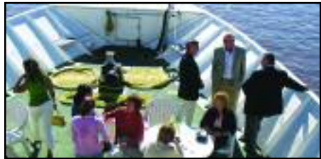
Recent SJH Foundation Auxiliary fundraising cruise on the Spirit of Philadelphia.

The SJH Foundation Auxiliary proves that you don't need to be a doctor to help people feel better. You'll play a vital role in creating a caring, comfortable environment for our patients. And we're always eager to welcome new members! With the