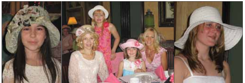
All dressed up for Mother's Day High Tea

The South Jersey Healthcare Auxiliary held its second annual Princess Party on March 18th at the SJH Fitness Connection Community Room in Vineland. Two parties hosted over 100 princesses, ages two through six who enjoyed nail painting, crafts, snacks, and were then treated to a loot bag and complimentary photo. Our princesses also met real princesses Snow White, Belle and Sleeping