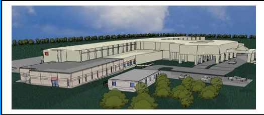
South Jersey Healthcare – Elmer Hospital